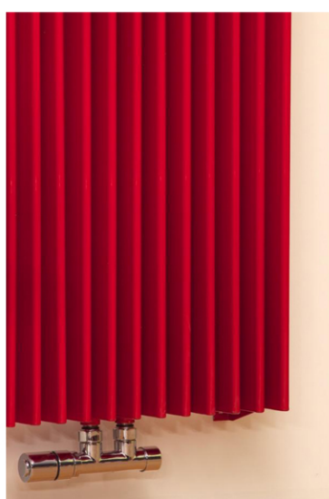
Centre connection standard